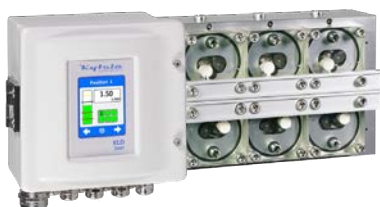
KLDS-8 with SR6 meter block